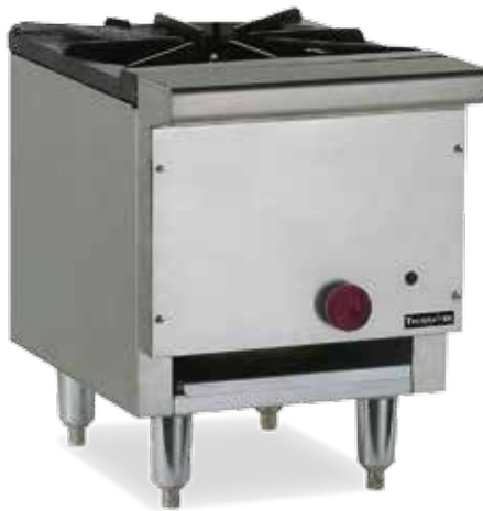
JET BURNER STOCK POT