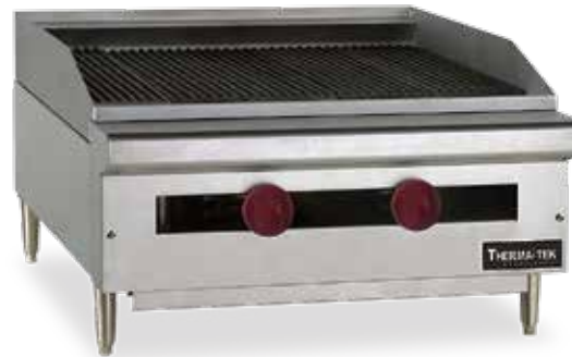
CHAR ROCK BROILER