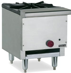
TJBSP18 (Shown with optional Jet Burner)